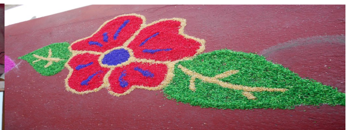
Left: SVN students performs a beautiful dance. Above: This is one of several pieces of art on the SVN lawns made from rice and color.