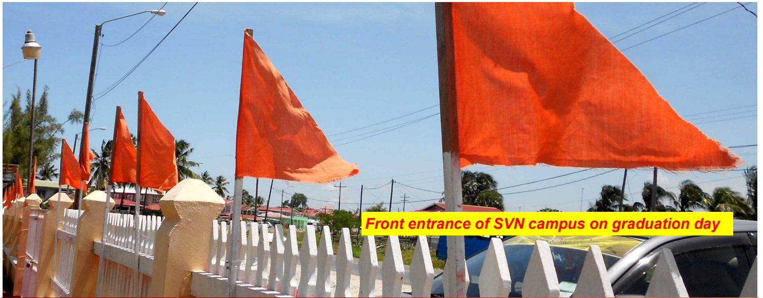
Front entrance of SVN campus on graduation day

SVN's Students, Staff and Volunteers — Glimpses of Karma Yoga at SVN