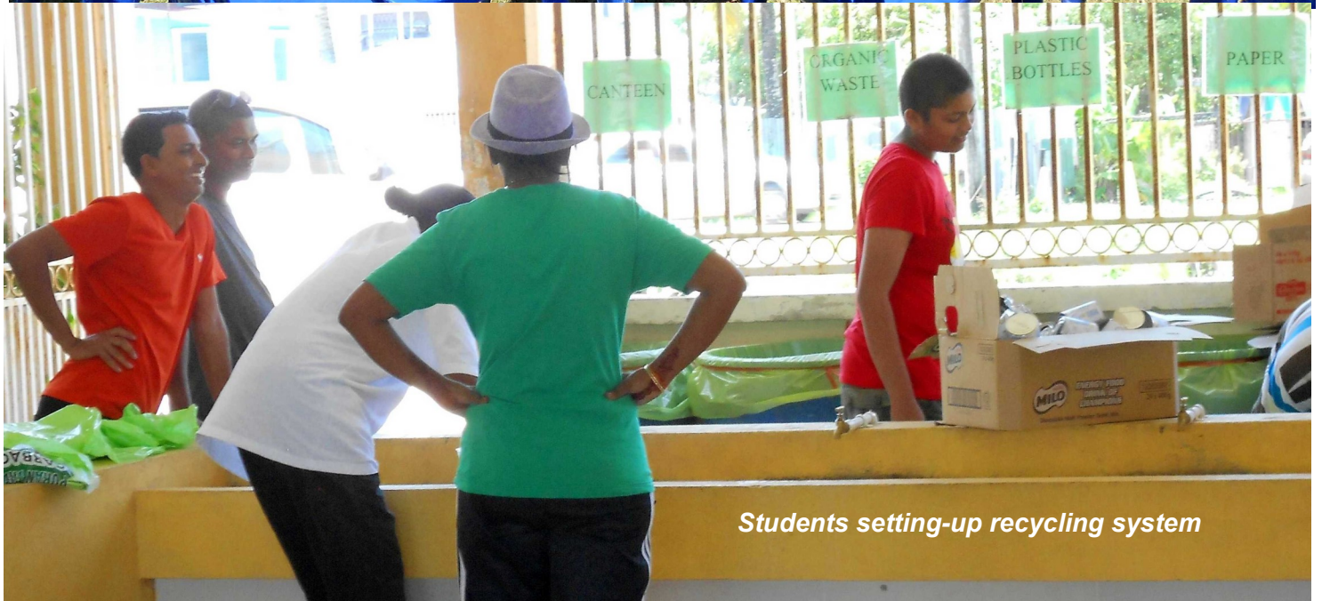
Students setting-up recycling system