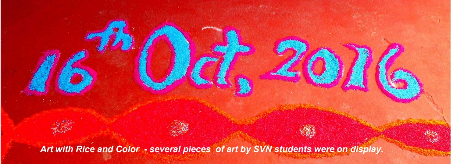
Art with Rice and Color - several pieces of art by SVN students were on display.