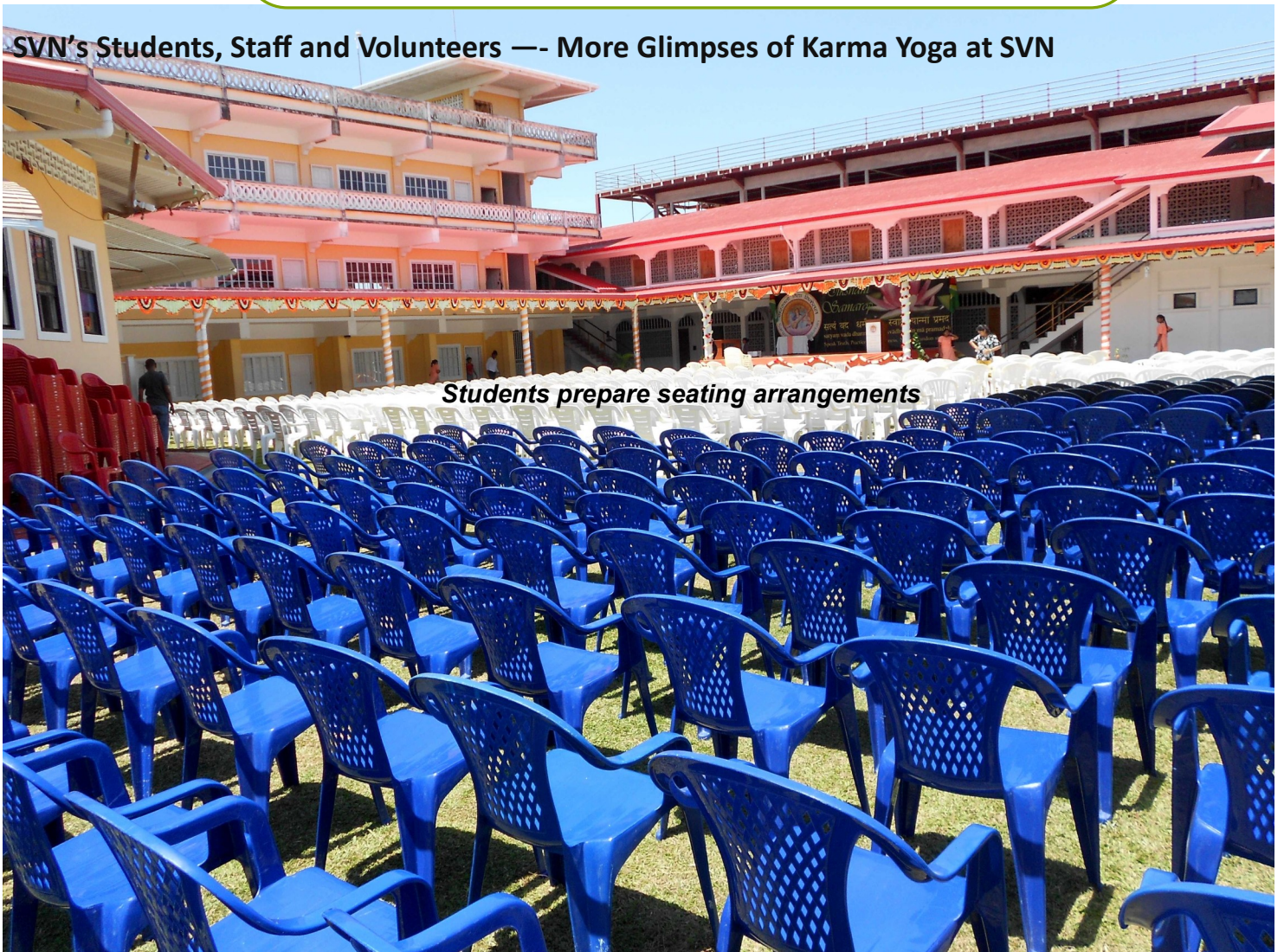
Students prepare seating arrangements

SVN's Students, Staff and Volunteers — More Glimpses of Karma Yoga at SVN