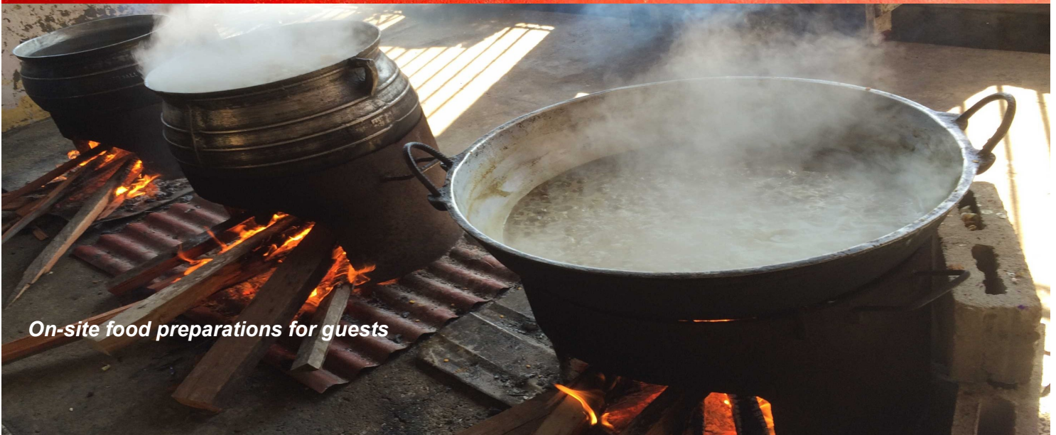
On-site food preparations for guests